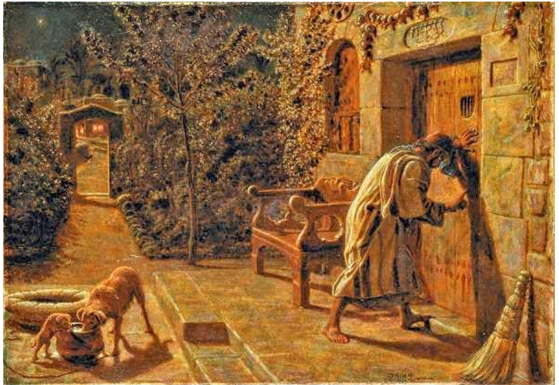
"The Importunate Neighbor" William Holman Hunt 1827 - 1910