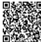
Holy Family Offertory

An additional $54,650 can be donated to this appeal which will be returned, tax free, to Holy Family